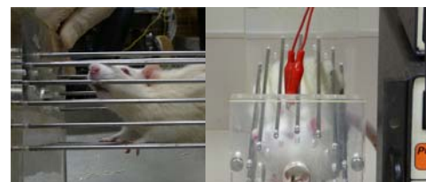
FIGURE 2. Restrainers Used for GES Delivery

The system includes a rack of 16 cages (A) with food hoppers mounted on a load cell. Hopper weights are transmitted to a computer (B) via a central controller hub (C). Specialized software on the computer identifies and records feeding events. Detailed images of the load cell and hopper are shown in (D) and (E).