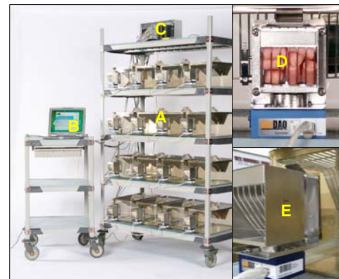
FIGURE 1. BioDAQ Continuous Food Intake Monitoring System

Sixteen male Sprague-Dawley rats, ~16 weeks of age, weighing an average of 550g, were implanted with pairs of 0.37mm stainless steel heart wires (A&E Medical Myowires) in the muscularis of the distal gastric antrum. Lead wires were externalized percutaneously on the animals' backs for connection to an external pulse generator. Prior to implant, the rats were conditioned to obesity with 6 weeks of 24 hour ad libitum access to a standardized high fat diet (Research Diets D12451, 45% of kcal from fat). After surgical recovery, the rats were conditioned to feed exclusively in a BioDaq continuous food intake monitoring system for 3 hours each day (FIGURE 1). The BioDaq monitor provided a complete record of both the quantity and timing of each rat's food intake over each 3 hour feeding. The rats were also acclimated to spend 60-90 minutes in a custom built restrainer with alligator clip wires attached to the externalized lead wires just prior to daily BioDaq feedings (FIGURE 2); in the subsequent experiment, these restrainers were used for pre-feeding GES delivery.